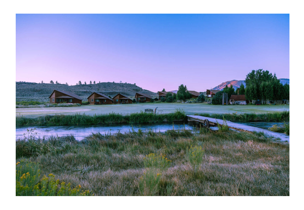
Trip starts Hot Creek Ranch July 9, 2021

Check in time is 4:00 P.M. Friday NOT BEFORE!