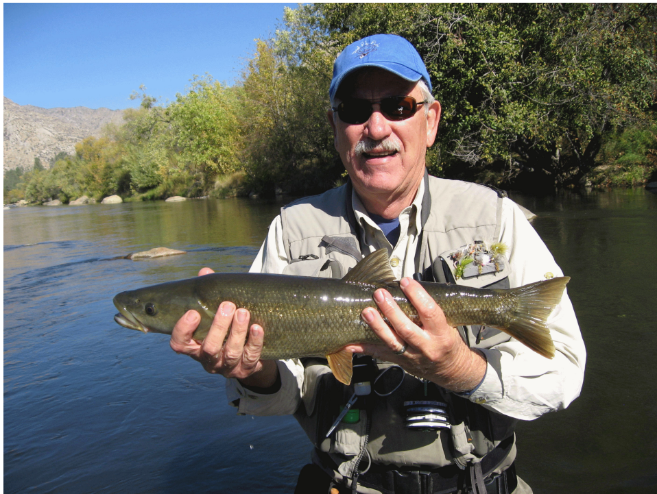
Your Editor with a nice Pike Minnow Caught on the Kern River