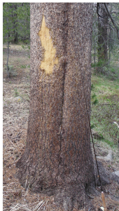
Larry Behm found this fresh bear marking reminding us all that this is a wilderness area!