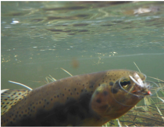
Great underwater picture from Larry Behm of an eager Golden Trout.