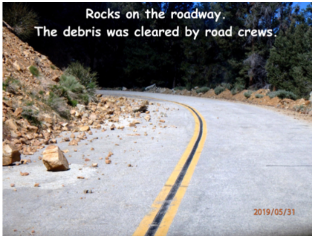
Some challenge driving into the campground.