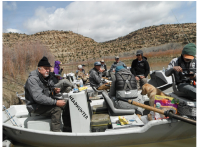
Lunch Break Under watchful eye of "Sammy"