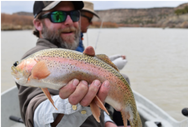
A colorful Rainbow