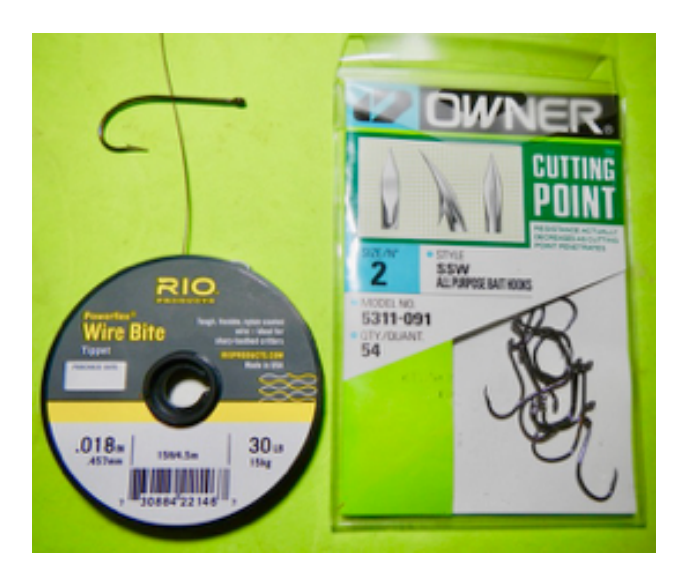
Long shank hook in heavy wire, Wire Bite & Owner SSW #2

Main Shank hook everything is tied to: #2 Bass Hook but any stout shank will do