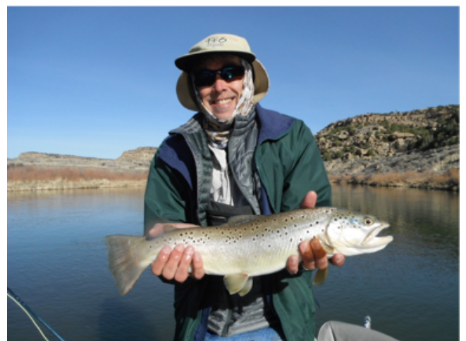
I wonder who got this nice 23 inch Brown ?!!!