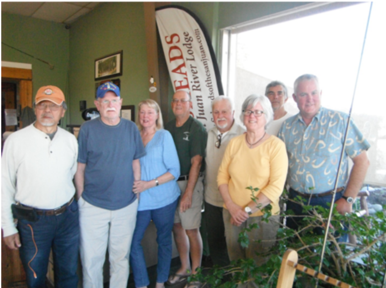
Gathering at Fishead's Fly Shop for the traditional group picture. The cast of regulars.