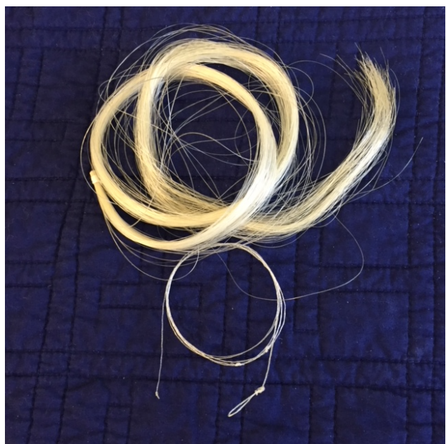
Hank of horse hair above, furled leader below