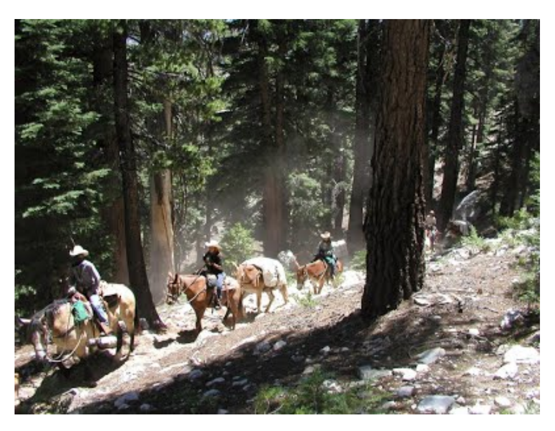
Five Days of Backcountry Fishing July 10-14, 2017