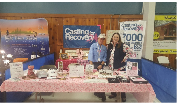
Casting for Recovery