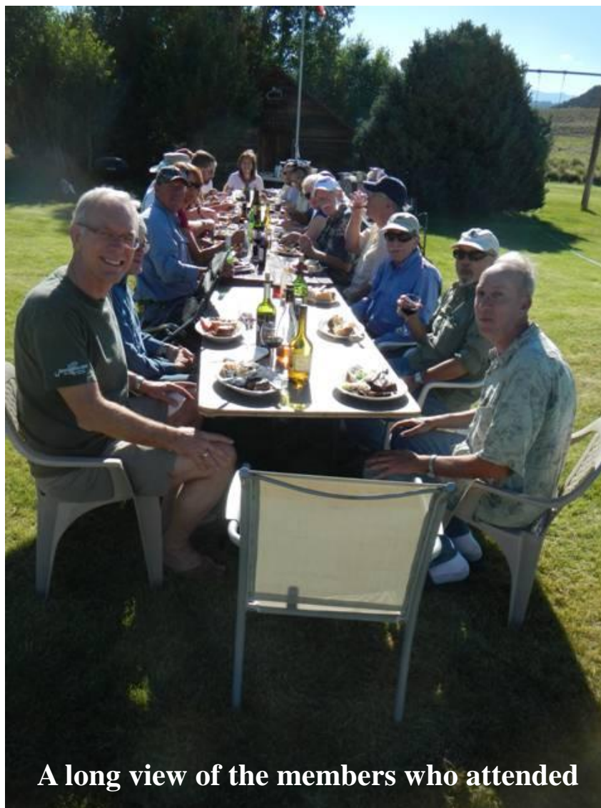
A long view of the members who attended