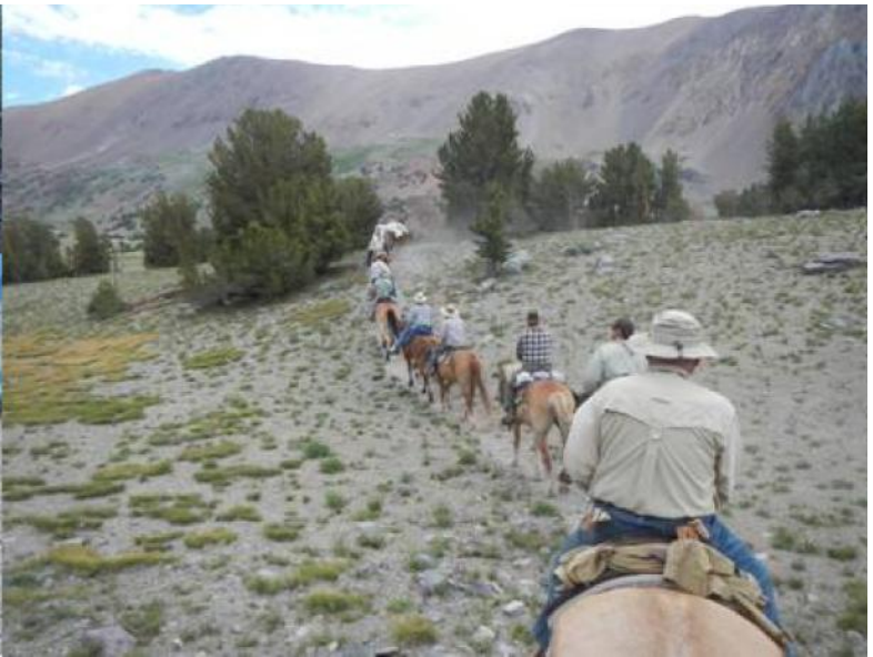
Bruised Bottom Gang will ride again