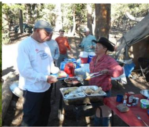
Camp meal served by the cook, TRIP, 5 foot zero