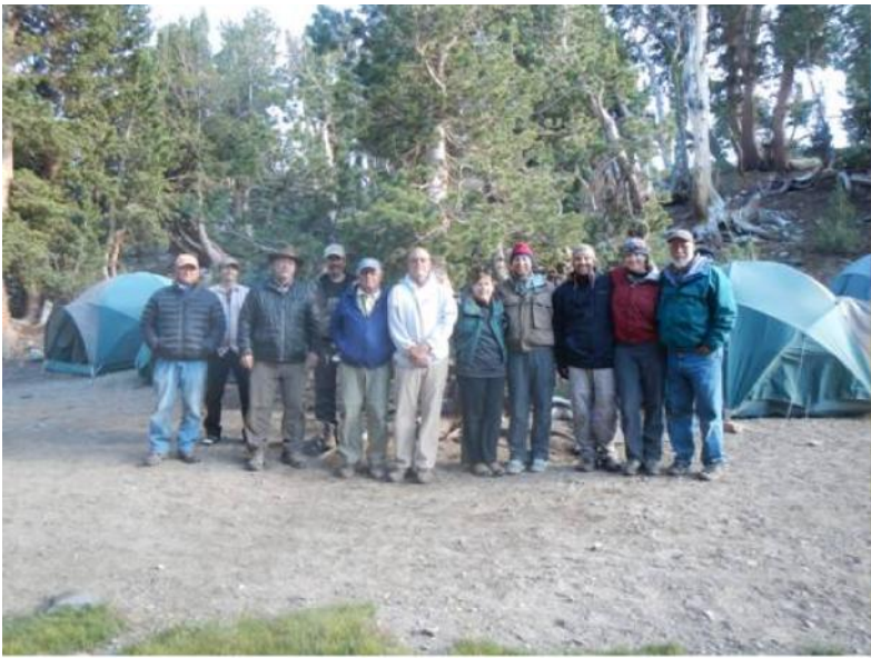
The Bruised Bottom Gang in living color at Alger's camp