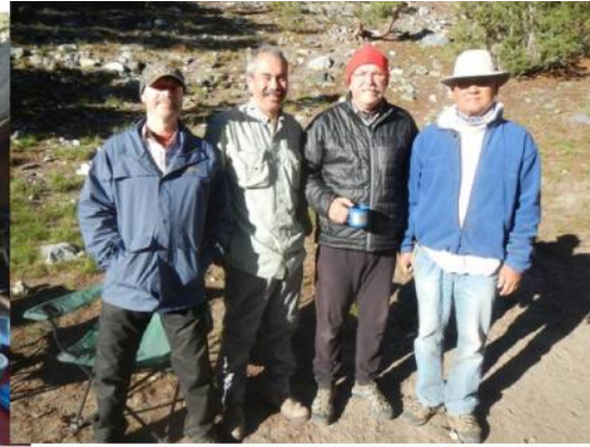
The line up before breakfast