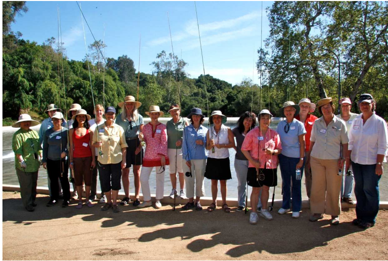
(Above photo is from the first annual women's fly fishing clinic in 2011)

If you are one of the fairer sex, come join us at the second annual Women's Fly Fishing Clinic. This comprehensive workshop covers all of the basics of fly fishing: casting, reading the water, entomology, equipment selection, fly tying, knots, landing and releasing fish with plenty of hands-on practice. Whether you are a neophyte or simply want to hone your fly fishing skills, this clinic will provide the perfect opportunity to learn, review and improve your fly fishing skills in a positive, fun and engaging environment.