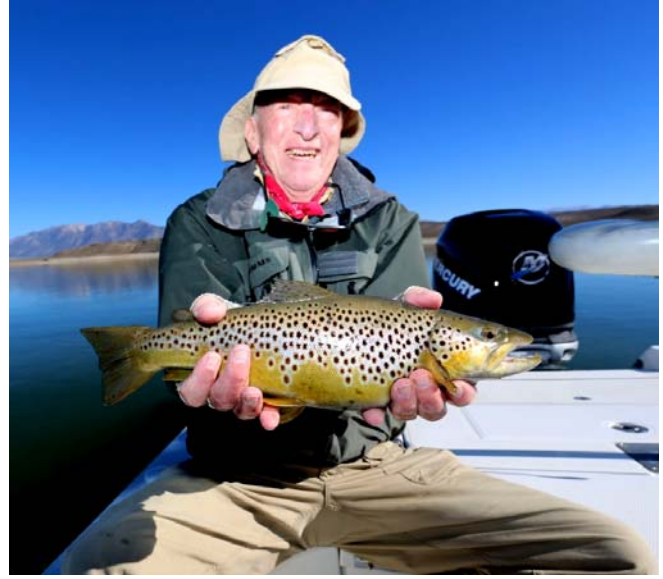
B - Brown