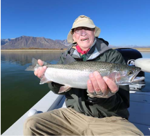
A - Rainbow