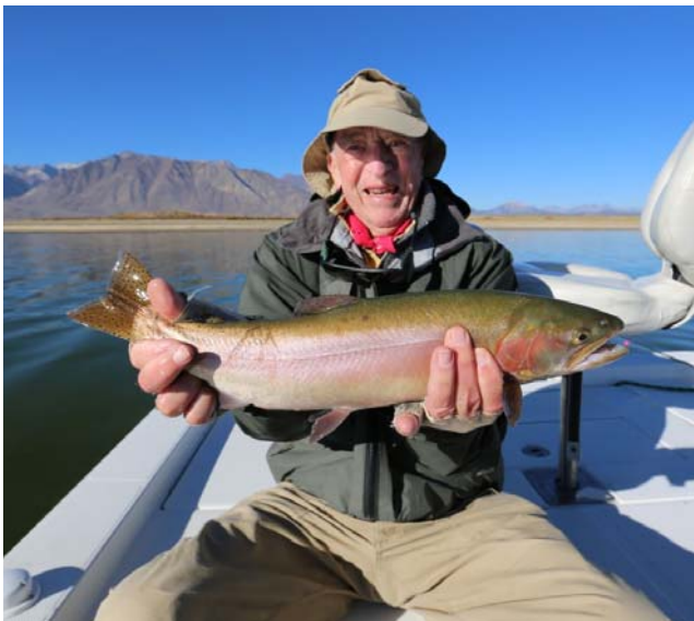
C - Cutthroat